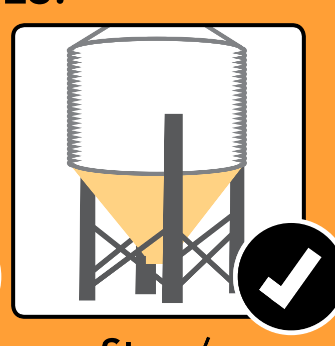
Store/ secure feed