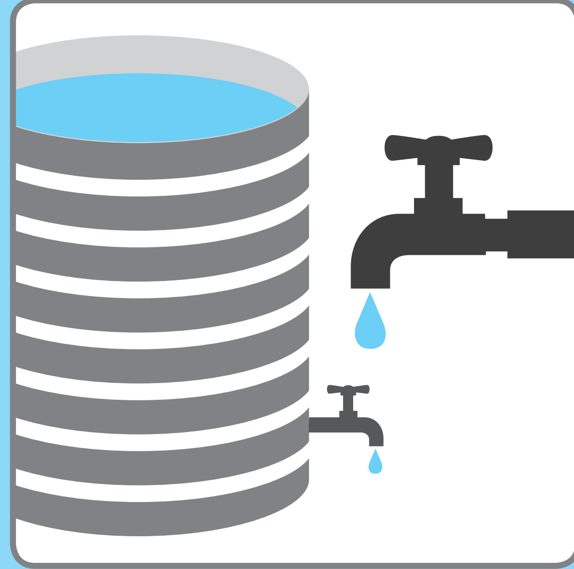
Untreated drinking or cooling water