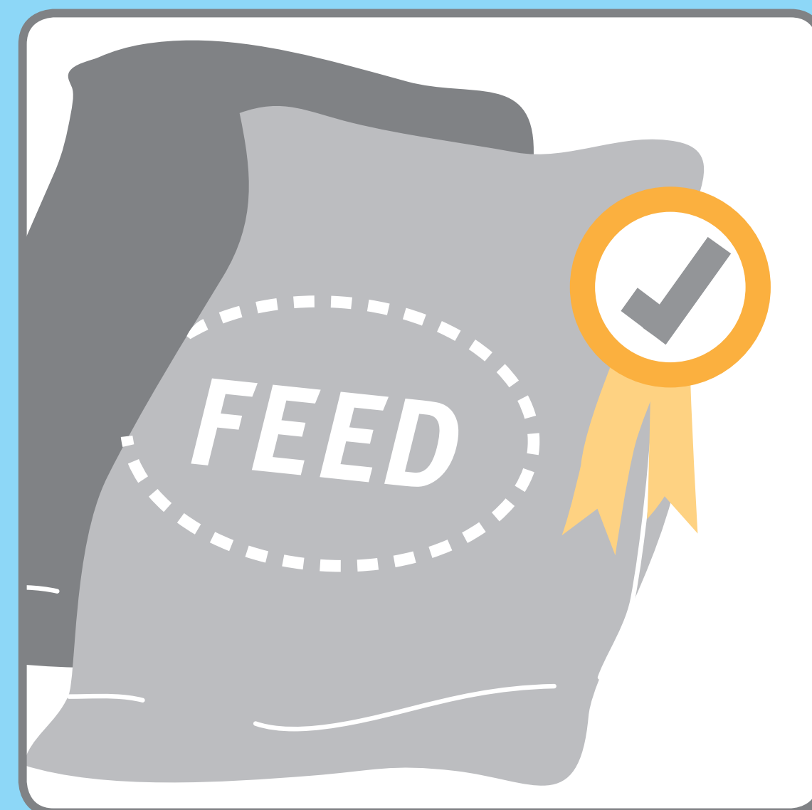
Certified feed supplier