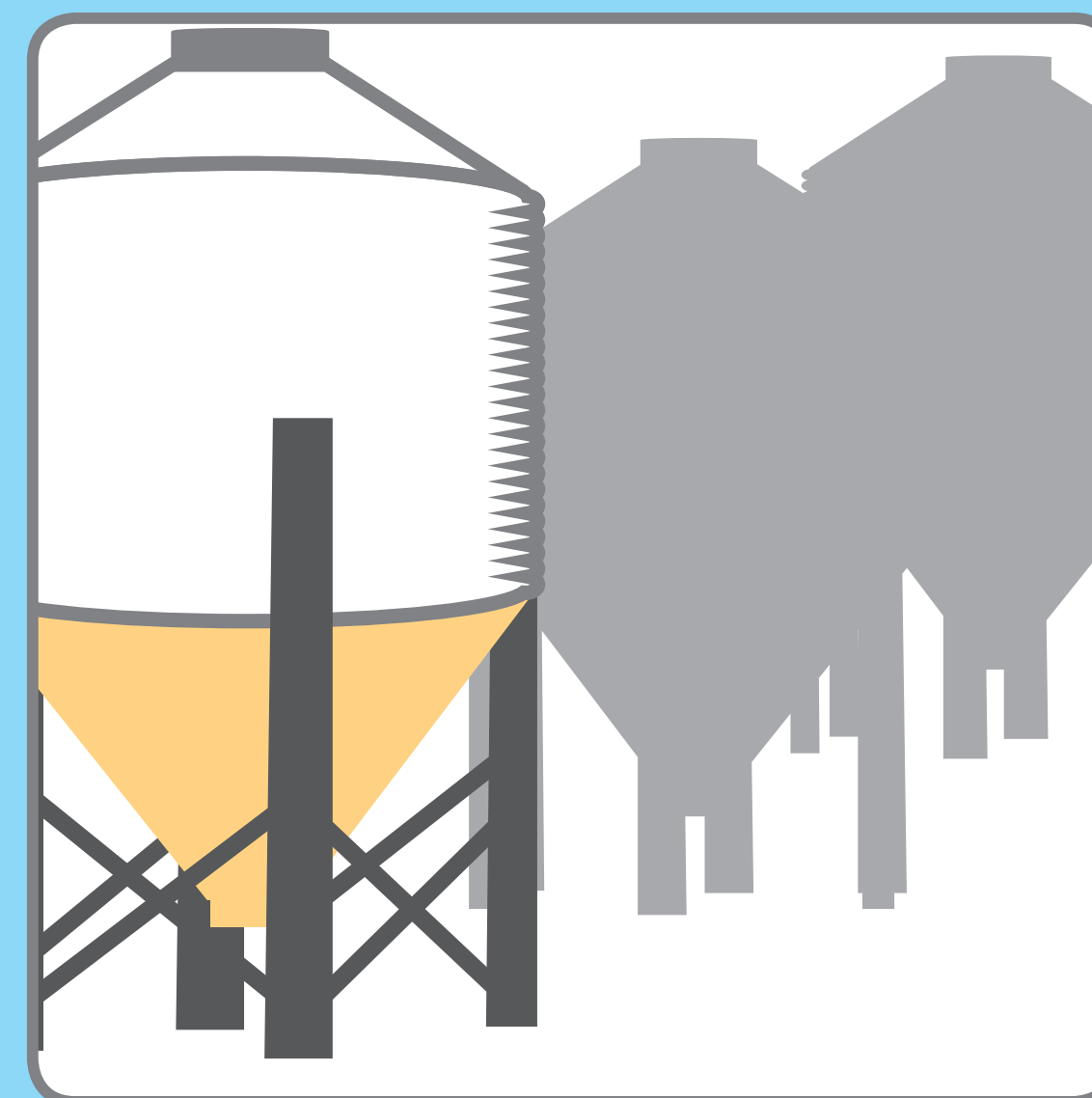
Covered feed storage